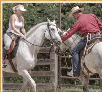
English & Western Welcome