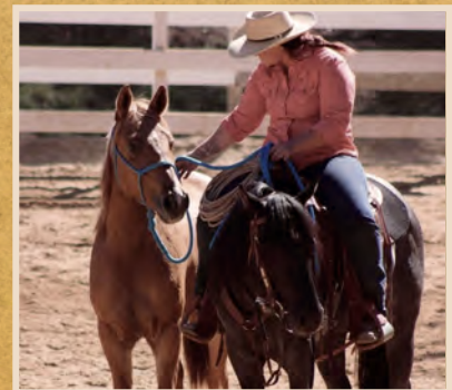
Young or Troubled Horses